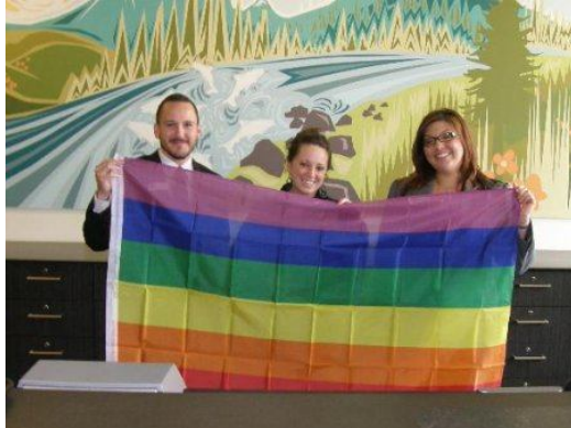
Employees at Umpqua Bank show their Pride

The Broadway BIA has PRIDE flags for all BIA members. If you don't already have one, come by the CHCC office.